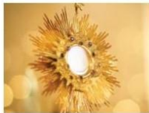
HOW CAN I HELP?